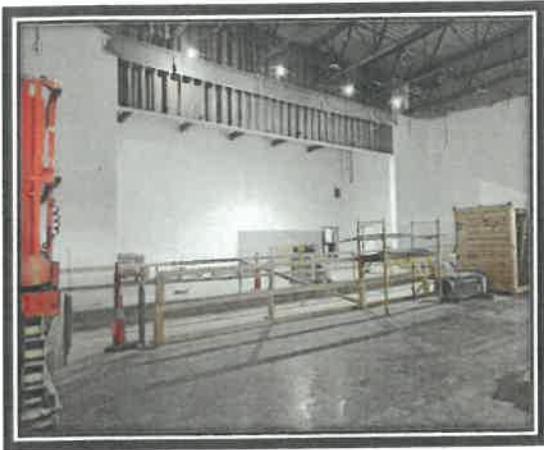
25.11.12 - Student Dining & Stage