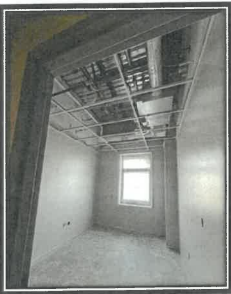
25.11.25 - Administrative Offices