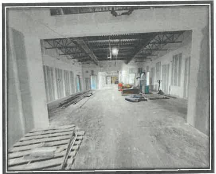
25.11.12 - Area D Drywall Finishing