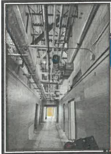
25.11.12 - Area B Corridor