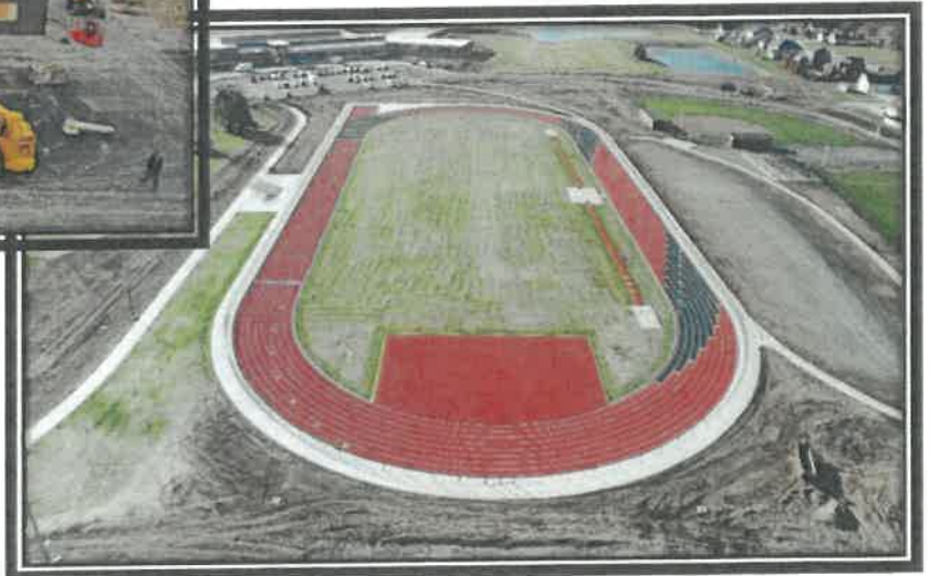
25.11.26 - Track Surfacing & Striping