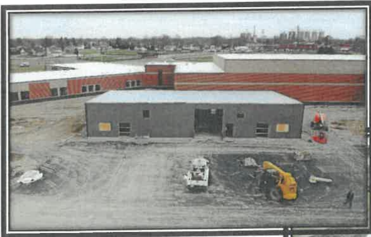
25.11.25 - Vo-Ag Building