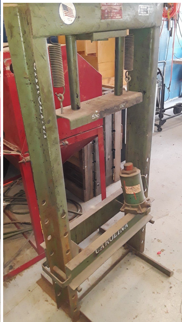
1 - Very old 30 ton Carolina hydraulic press